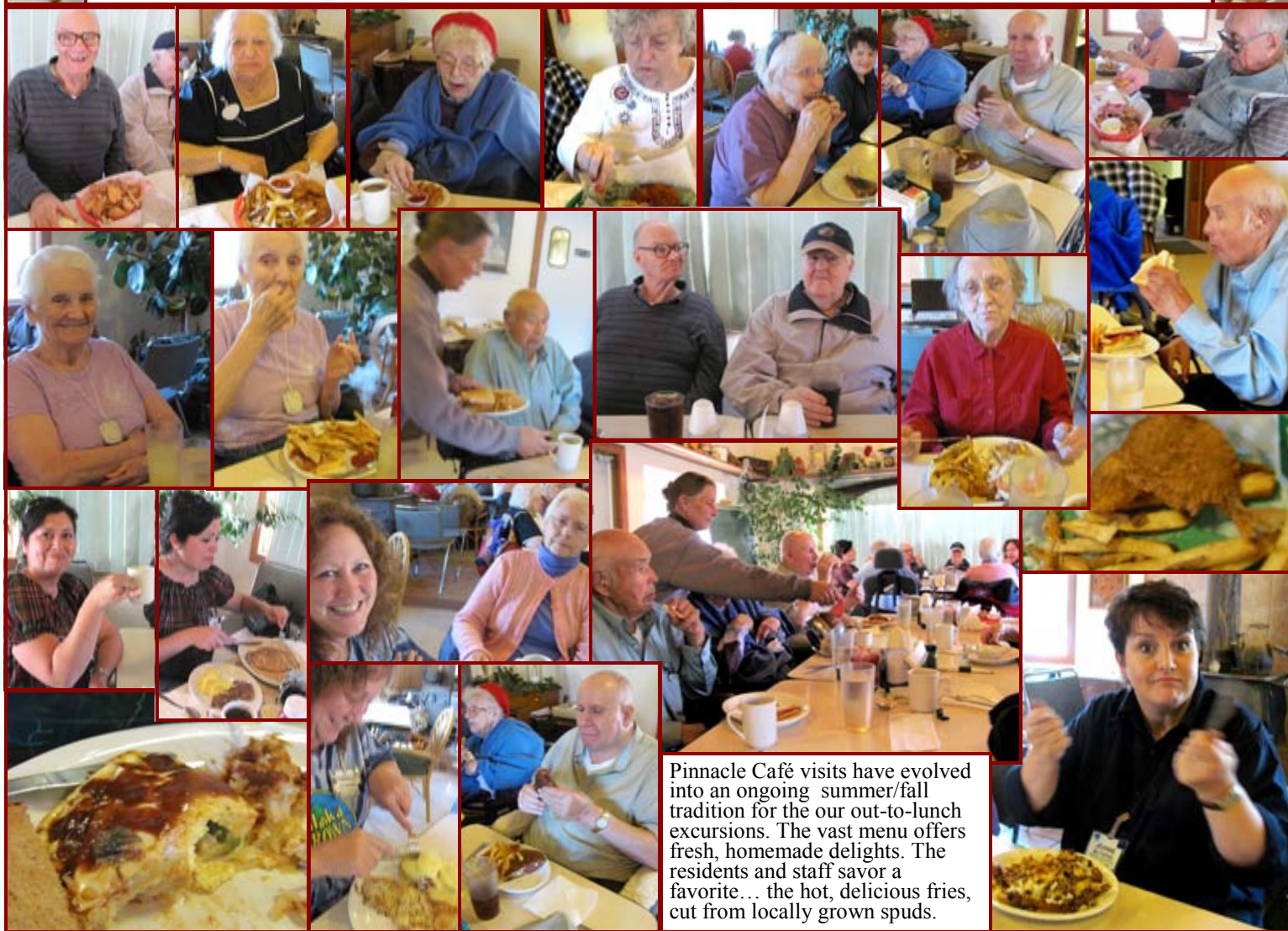
Pinnacle Café visits have evolved into an ongoing summer/fall tradition for the our out-to-lunch excursions. The vast menu offers fresh, homemade delights. The residents and staff savor a favorite... the hot, delicious fries, cut from locally grown spuds.